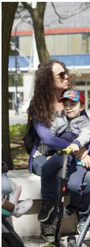
PHOTO: Resting in Cabot Square during the Family Discovery Walk.