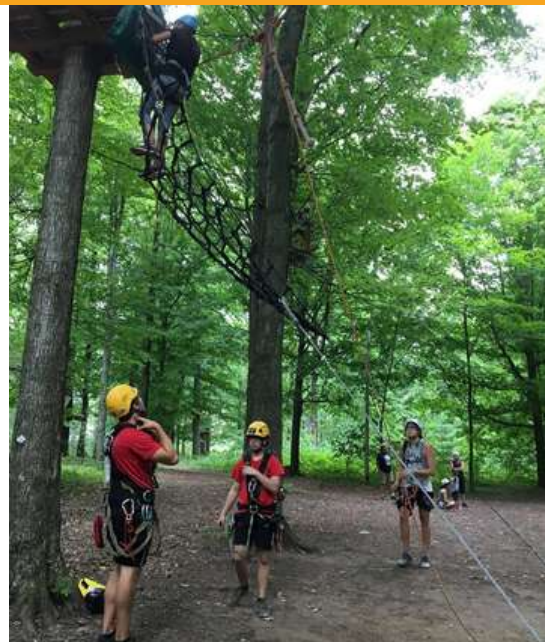
PHOTO: Youth tree walking activity in Arbraska

80 people participated in networking and skills development activities for local community workers (1 speed networking session at the downtown YMCA, 1 networking breakfast at the YWCA and 1 training on the realities and cultures of Indigenous peoples).