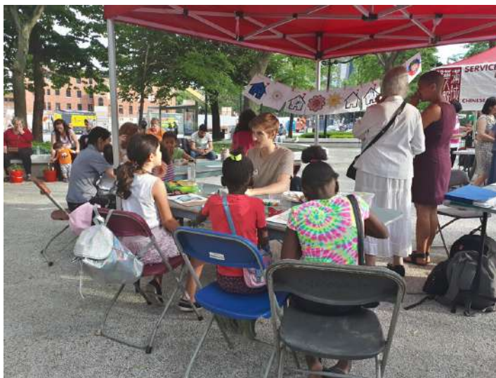
PHOTO: Kids doing arts & crafts at our summer block party in Cabot Square

Cabot Square Corn Roast ♦ Artisan Market ♦ Halloween Walk ♦ Winter Carnival ♦ Cabot Square Sugar Shack ♦ Summer Block Party